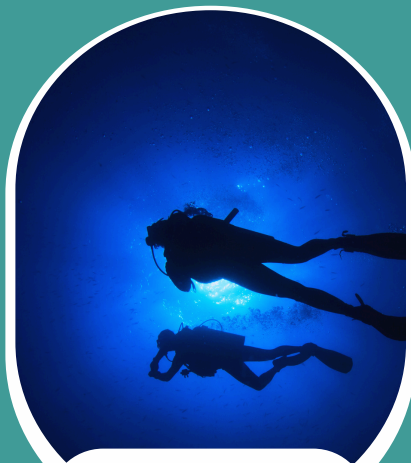
DIVING & SNORKELLING